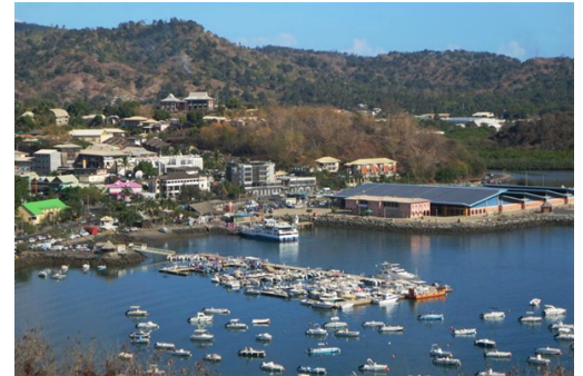
View of Mamoudzou, Mayotte, Sep. 15, 2003.